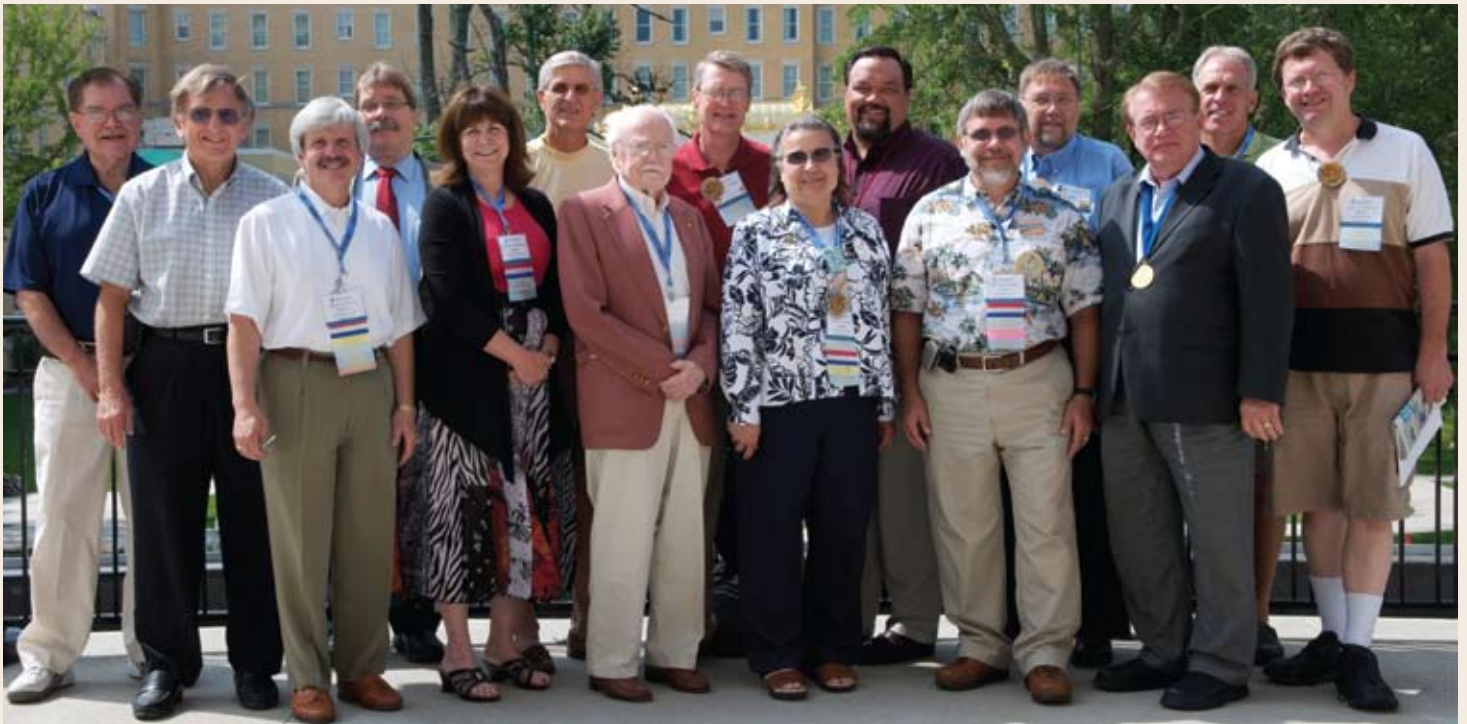
Past presidents of the IAFP pictured on the terrace of the new conference center